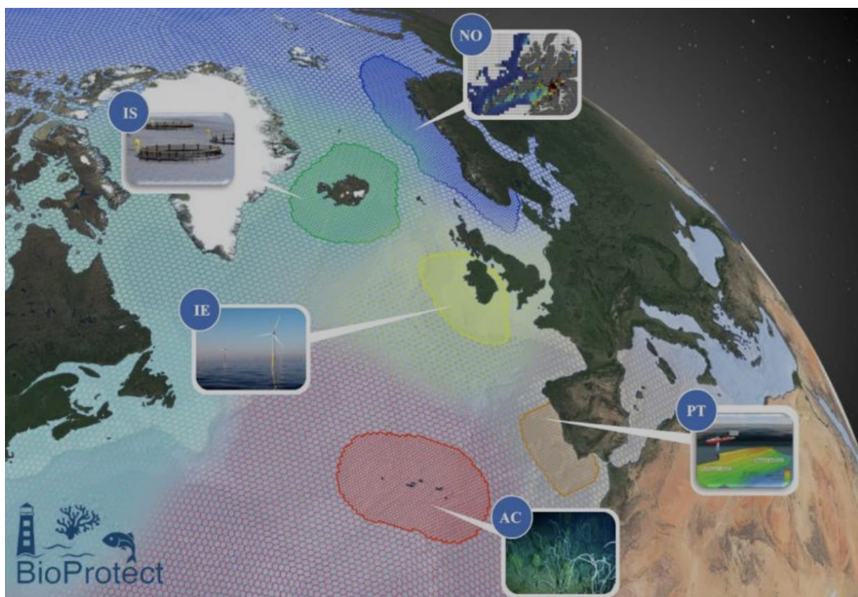
Figure 1. Map of the five BioProtect demonstration sites (NO - Norway, IS - Iceland, IE - Ireland, PT - Portugal, AC - Azores).